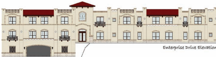
Enterprise Drive Elevation

Unique Retail/Office setting with excellent frontage