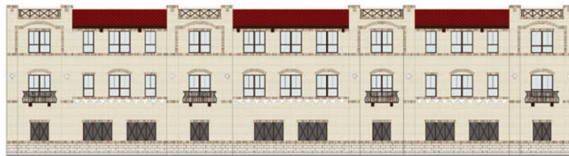
Long Prairie Road Elevation